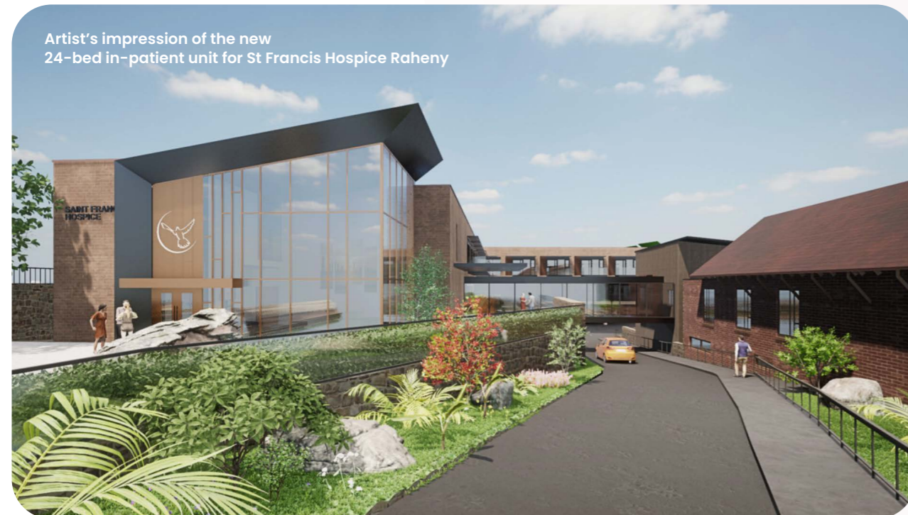
Artist's impression of the new 24-bed in-patient unit for St Francis Hospice Raheny