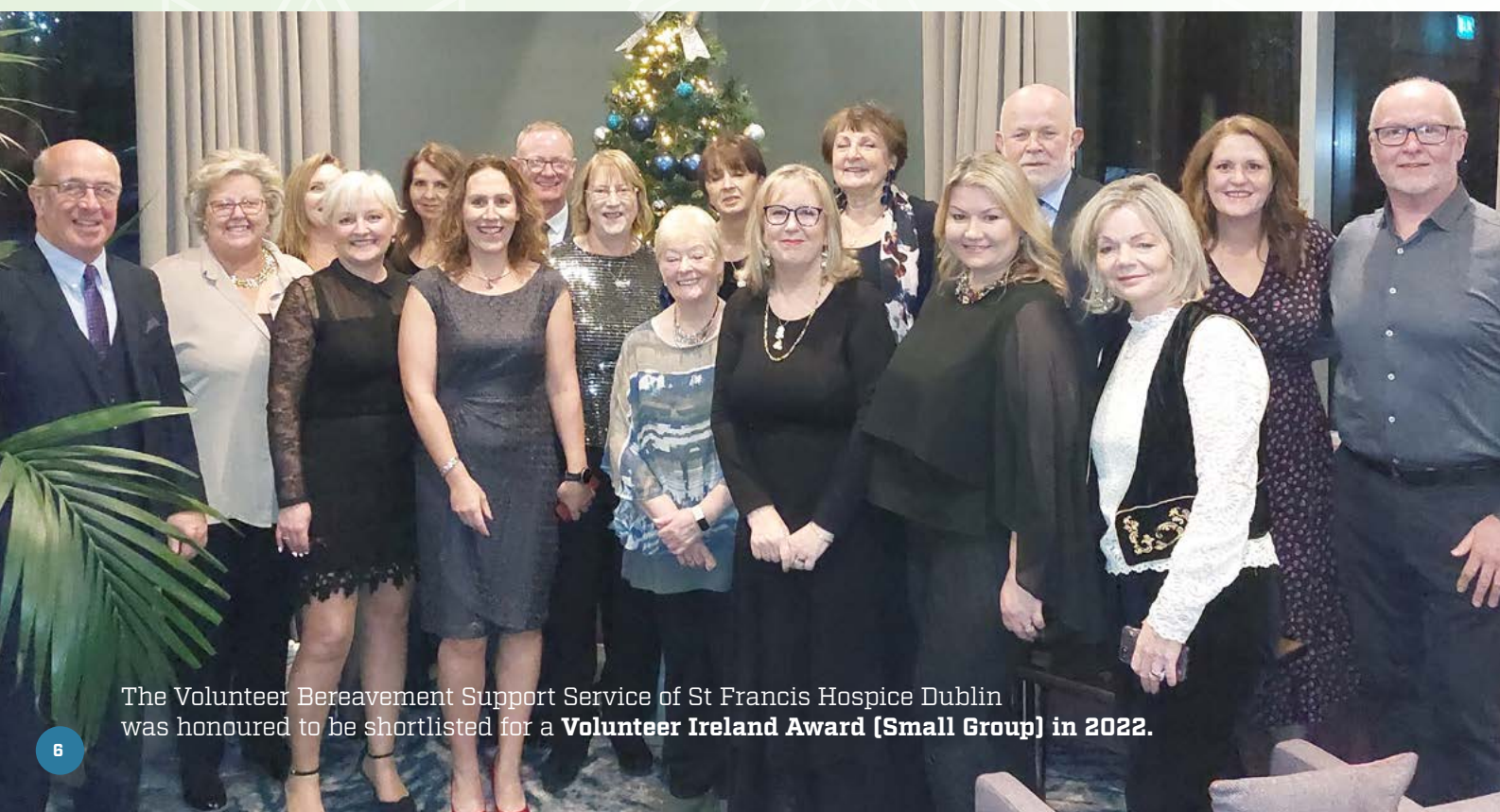
The Volunteer Bereavement Support Service of St Francis Hospice Dublin was honoured to be shortlisted for a Volunteer Ireland Award (Small Group) in 2022.